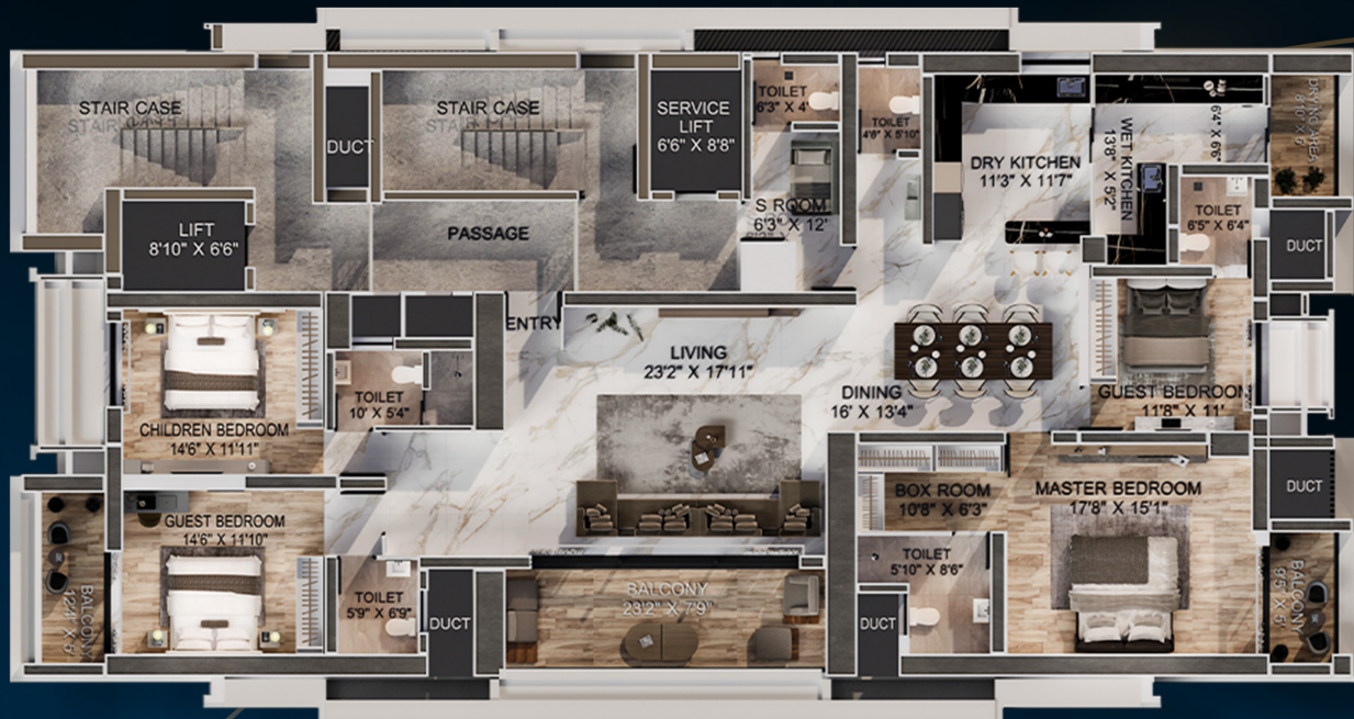
TYPICAL TOP VIEW